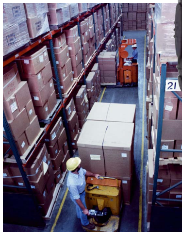
...AND for work!