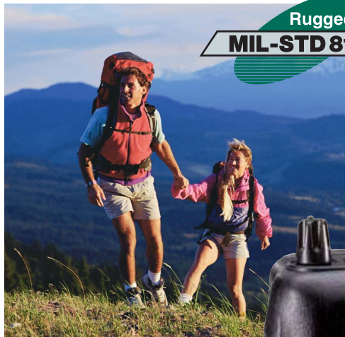
Use them for pleasure...